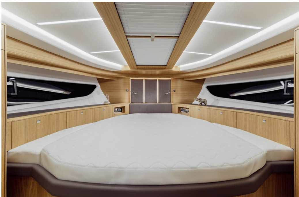
Notice the skylights above and lots of storage space