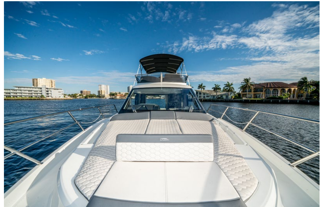
— Comfortable sunbathing area in the bow