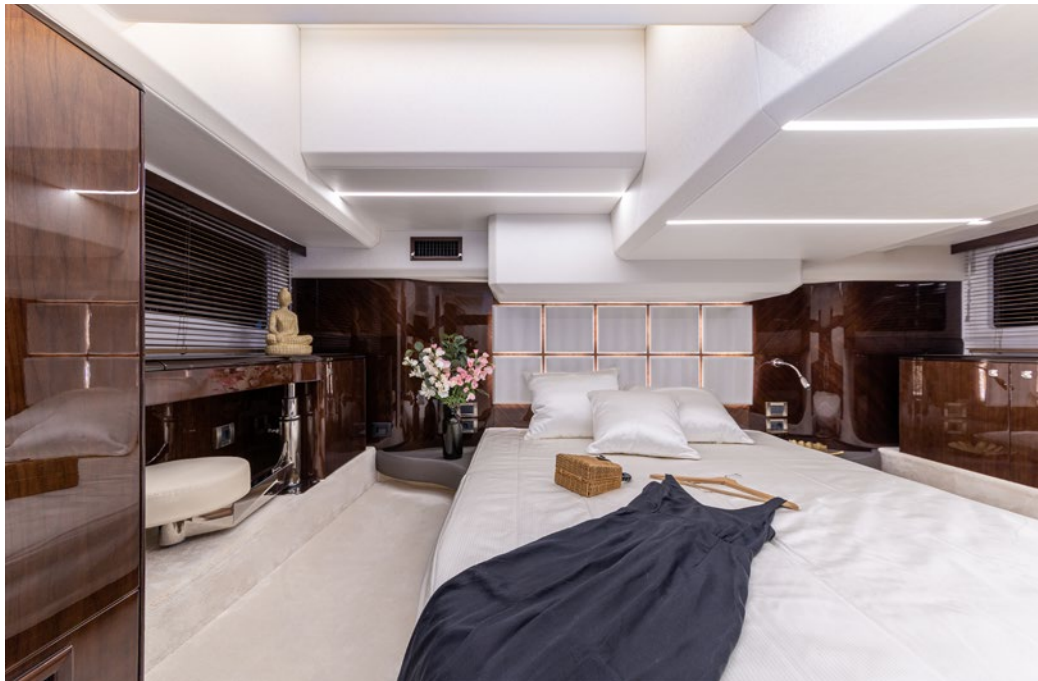
Hand-made headboard of a huge bed and an extendable seat in the master cabin —