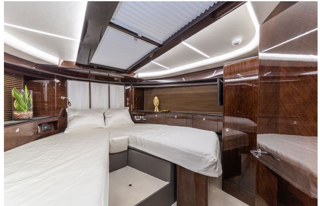
Guest cabin with en suite bathroom and glazing in the ceiling —