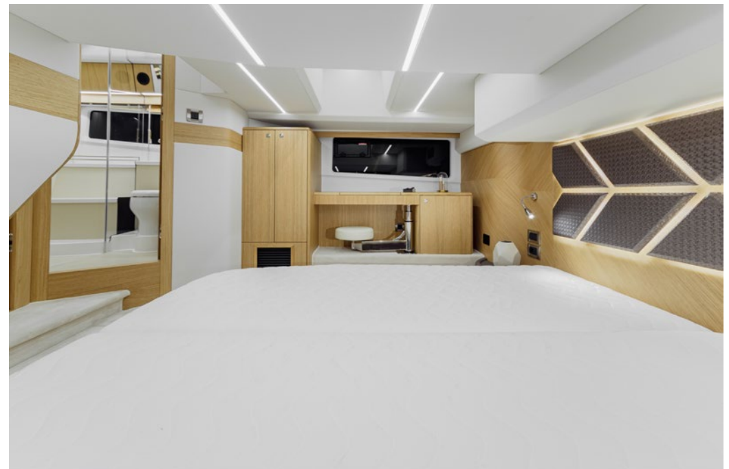
The master cabin features a rounded design, modern lighting and clever amenities