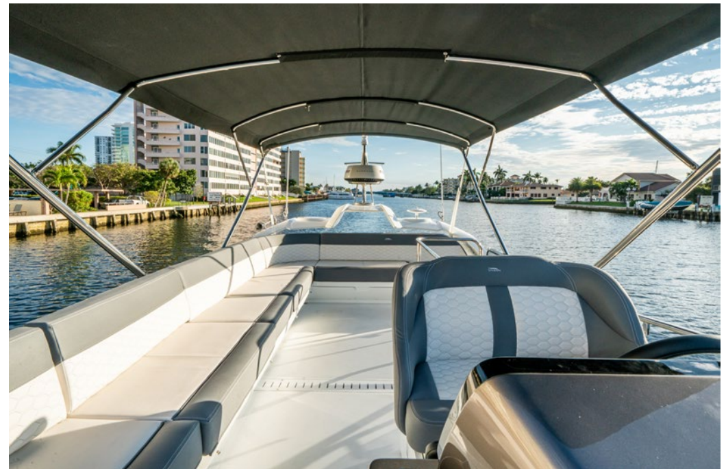
— Plenty of space to sit on comfortable sofas