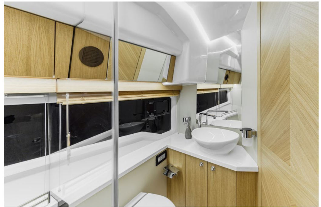
The bathrooms have a separate dry area