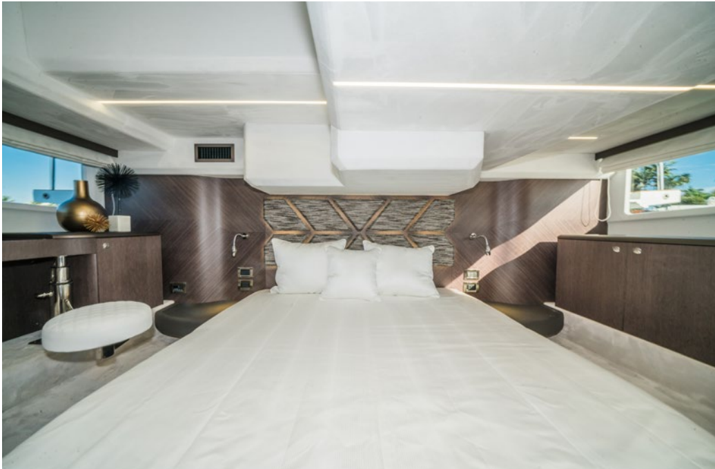
Notice the natural wood, alcantara and stainless steel elements that we finish by hand —