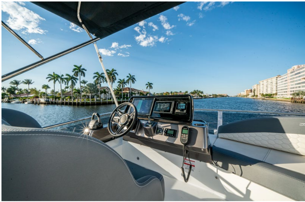
— Fully equipped helmsman's position on the flybridge