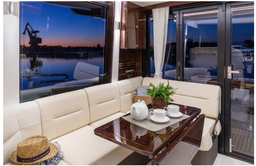
Elegant sofas create a wonderful space to receive guests —