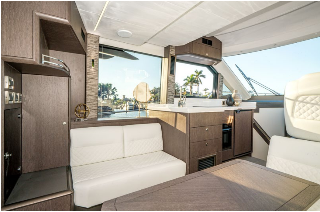
A single windshield combined with huge windows allows you to enjoy the wonderful views —