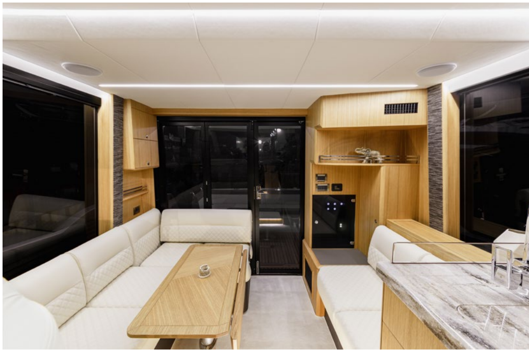
Folding door in the saloon allows you to open this space to the outside