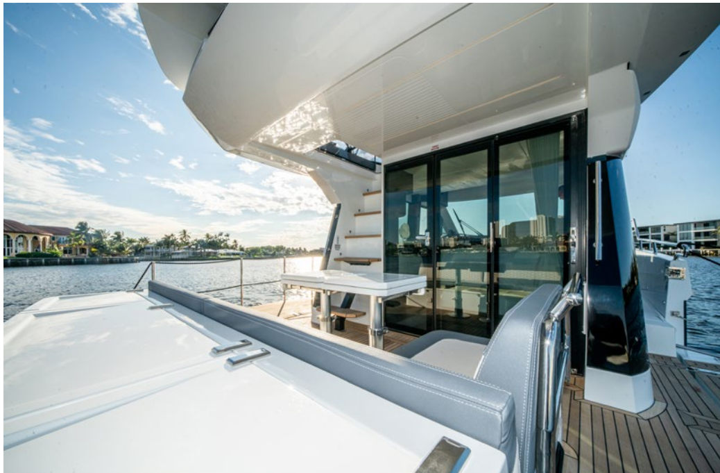
— Impressive wet bar with grill in the stern