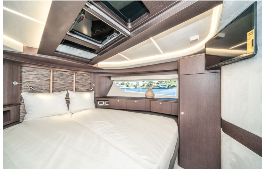
Guest cabin with en suite bathroom —