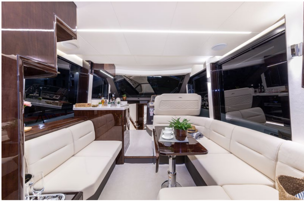
Impressive lighting and huge windows wonderfully illuminate the salon —