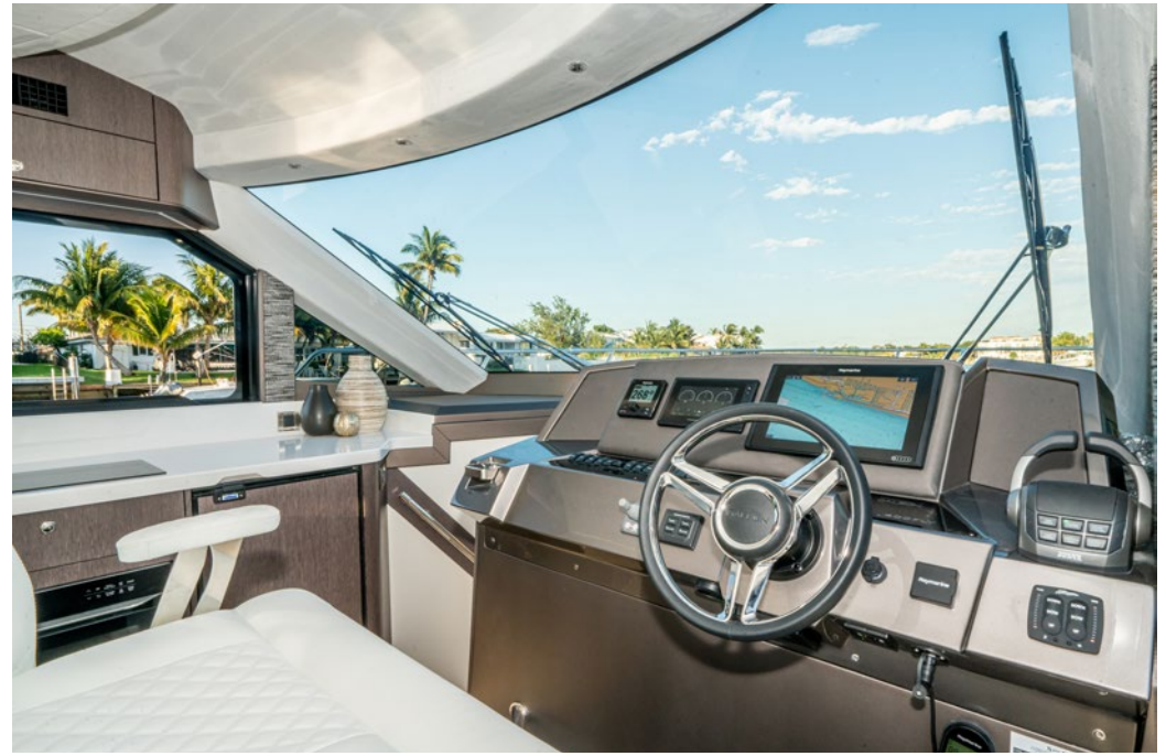
The full-size window at the helmsman's seat opens completely to the side —