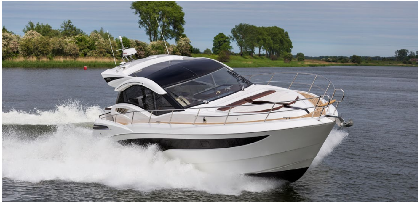
Tight handling and great performance