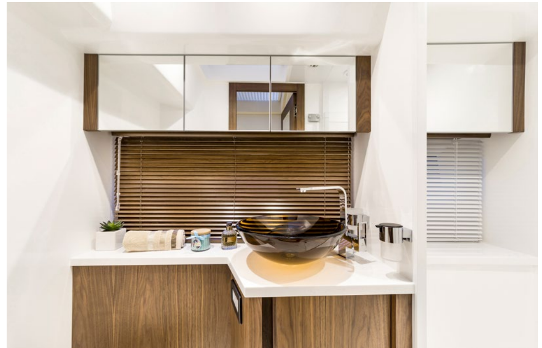
One of the two bathrooms below deck —