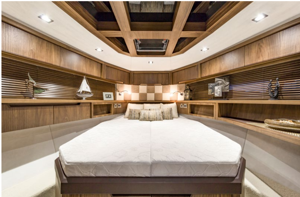
Forward VIP guest cabin with skylights above —