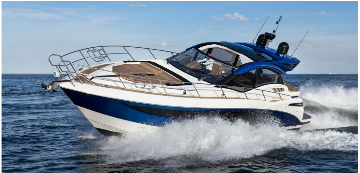
A sporty disposition of the 485 HTS —