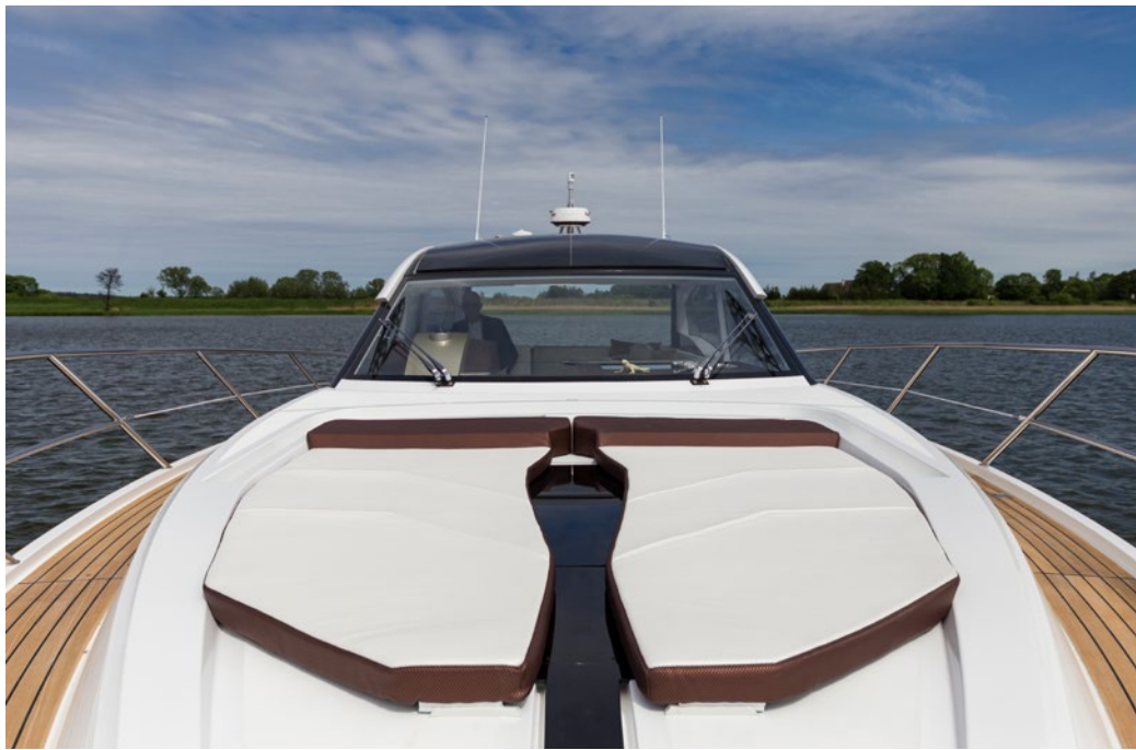
— Bow sundeck area