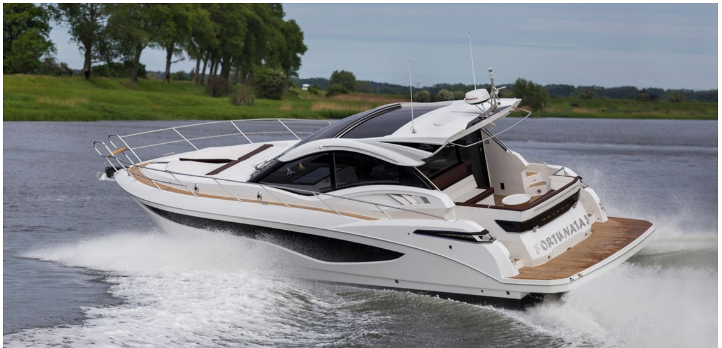
Make use of the available bath platform