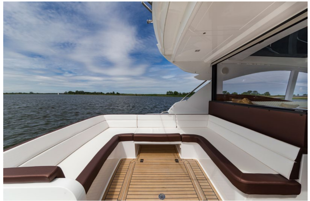
— Outside rest area