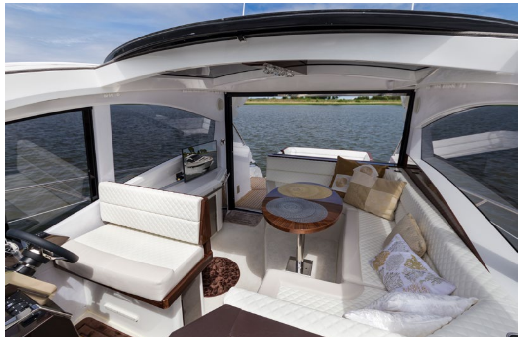
— Open the glass door and drop the window for an open cockpit experience