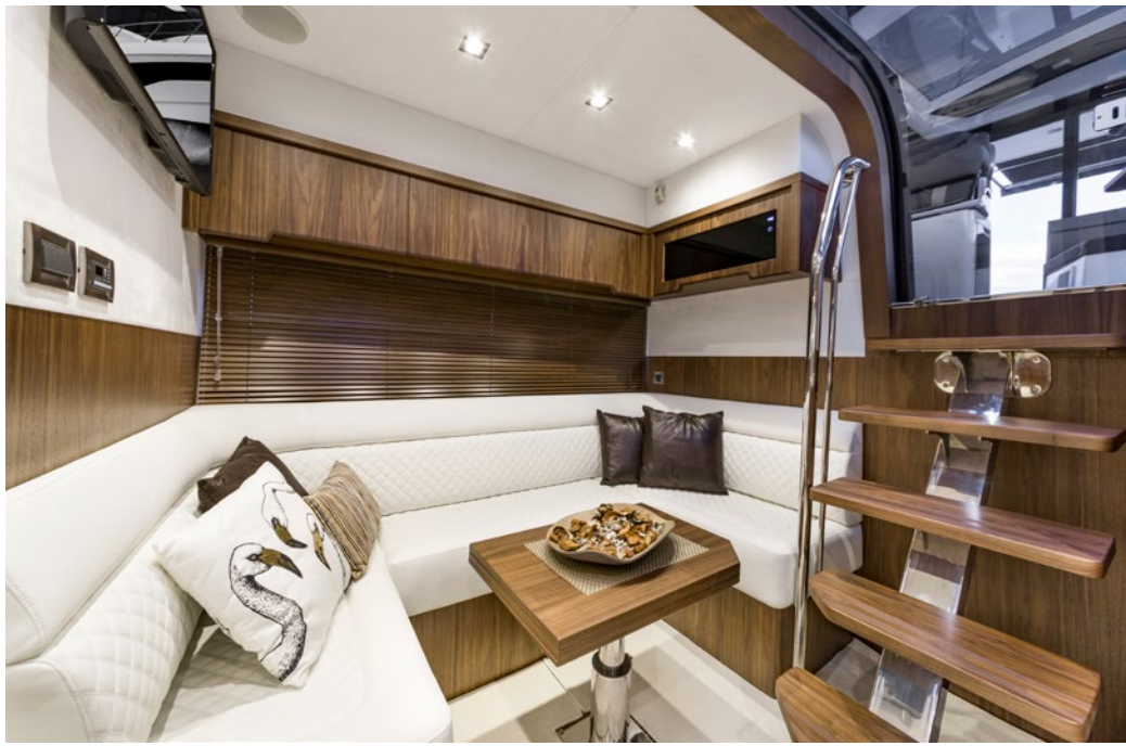
A dinette with a fold-out table —