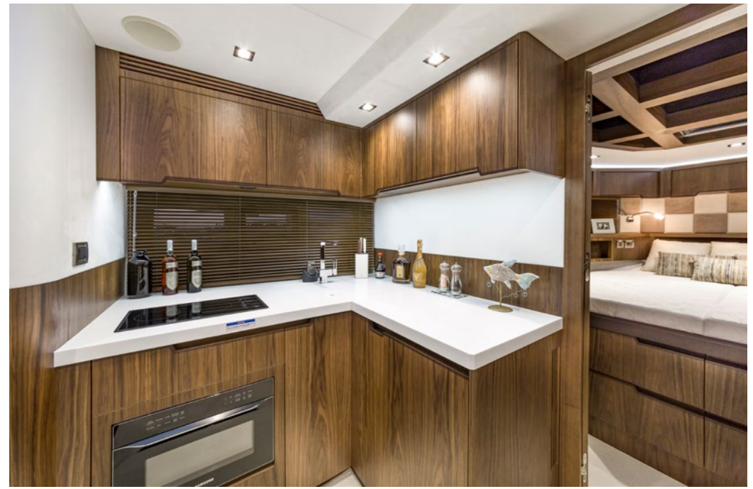
The compact galley will store all the necessities —