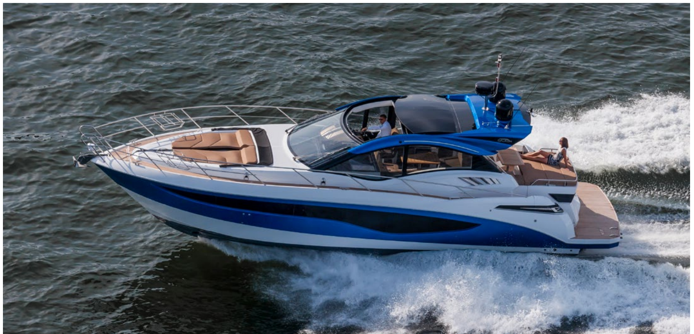
Perfect proportions compliment the sleek design —