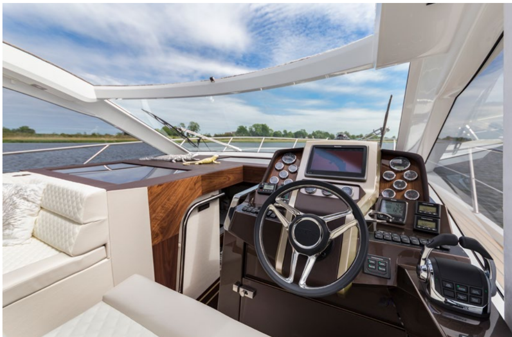
— Slide the sunroof and enjoy the breeze